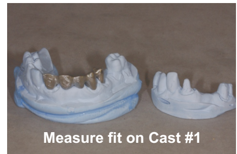
Measure fit on Cast #1