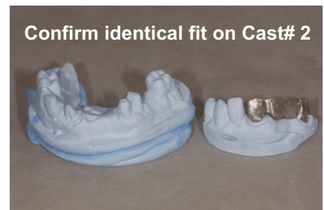
Confirm identical fit on Cast# 2