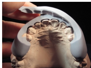
Split Putty Prep Guide with Preparation Study Cast