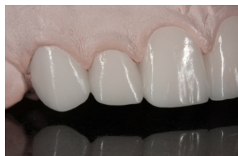
Diagnostic Wax-up Lateral Close-up

A: You will receive a preparation study model with a Split Putty Prep Guide that will allow you to accurately compare the preparation in the patient's mouth with contour of the diagnostic wax model. Differences can be identified and adjustments made to insure adequate reduction for the ceramist to fabricate optimal esthetics. Additionally, you will receive a Putty Matrix of the diagnostic wax that you can use as a mold to fabricate the patient's temporaries.